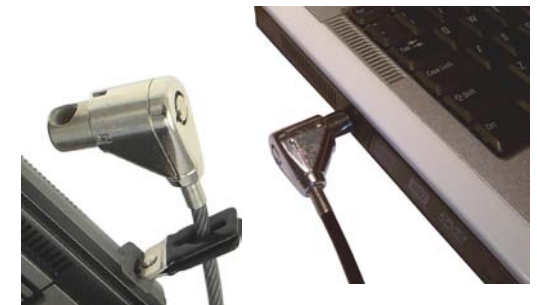
810 lock style