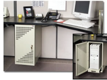
Full Locker Type Enclosure