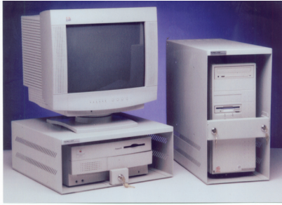
Universal Tower or Desktop Enclosure