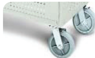
NOTEBOOK CARTS CAN BE ORDERED WITH 8" RUBBER CASTERS PERFECT FOR MOVING LAPTOPS ACROSS CAMPUS