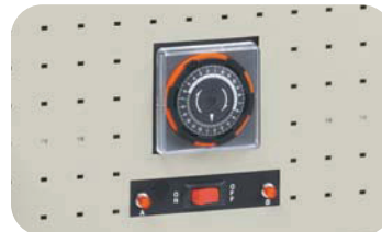
OPTIONAL: LAPTMR AUTOMATIC TIMER ALLOWS BOTH CHARGING UNITS TO BE PLUGGED INTO THE TIMER

Electrical units are UL listed, overload protected, includes a 20' power cord, and has an on/off switch located at the base. When using both electrical units at the same time, each unit must be plugged into outlets on separate electrical circuits. This is to prevent the overload and tripping of the circuit breaker. The electrical units are rated for a maximum of 15 amps usage each, however, to prevent nuisance tripping of the breaker you should not exceed 13 amps of usage each for an extended period of time.