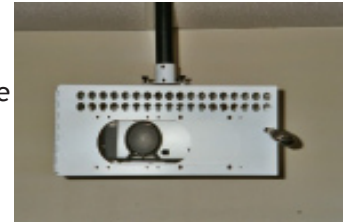
Dimensions: 20"w x 16"d x 9"h